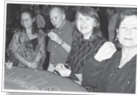
Players ante up to win big at the Blackjack table.