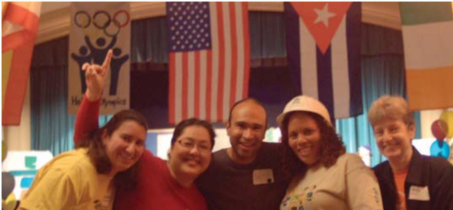
St. Monica parishioners join in the Habitat Olympic festivities!