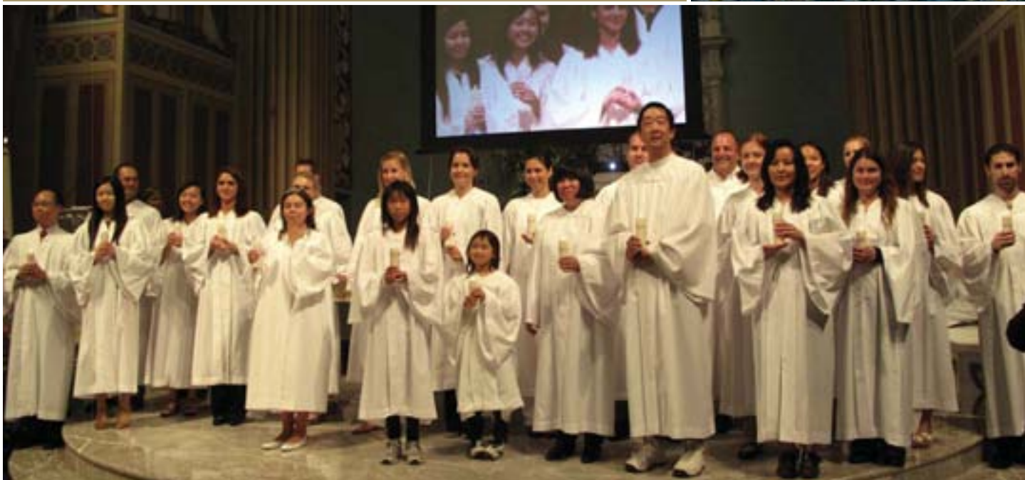
Holy Saturday participants gather around the altar following their reception into the Church.