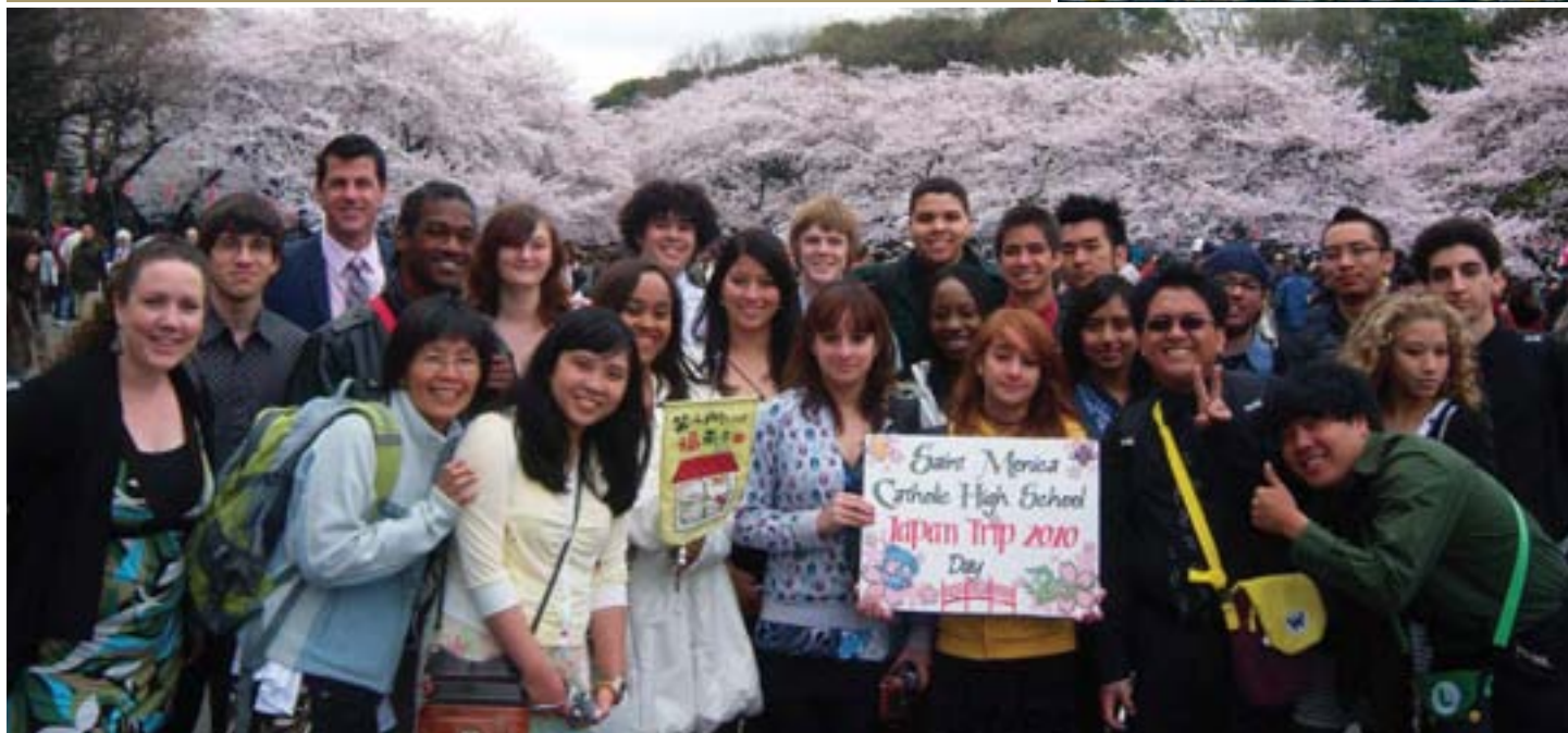
St. Monica Catholic High School students in Japan this spring.