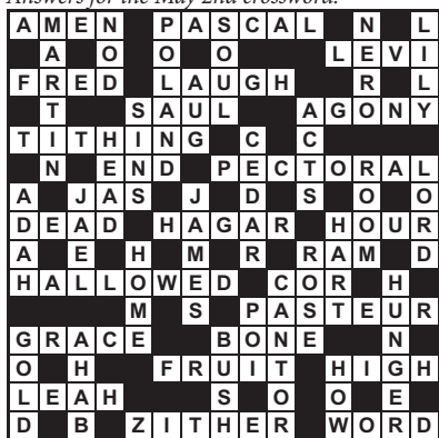
Answers for the May 2nd crossword.