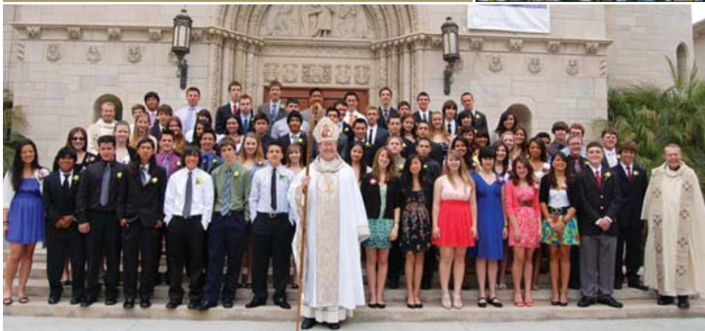
St. Monica Teens receive the gifts of the Holy Spirit at the Confirmation Ceremony.