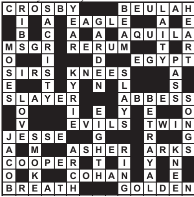
Answers for the May 9th crossword.