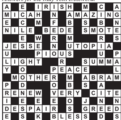
Answers for the May 16th crossword.