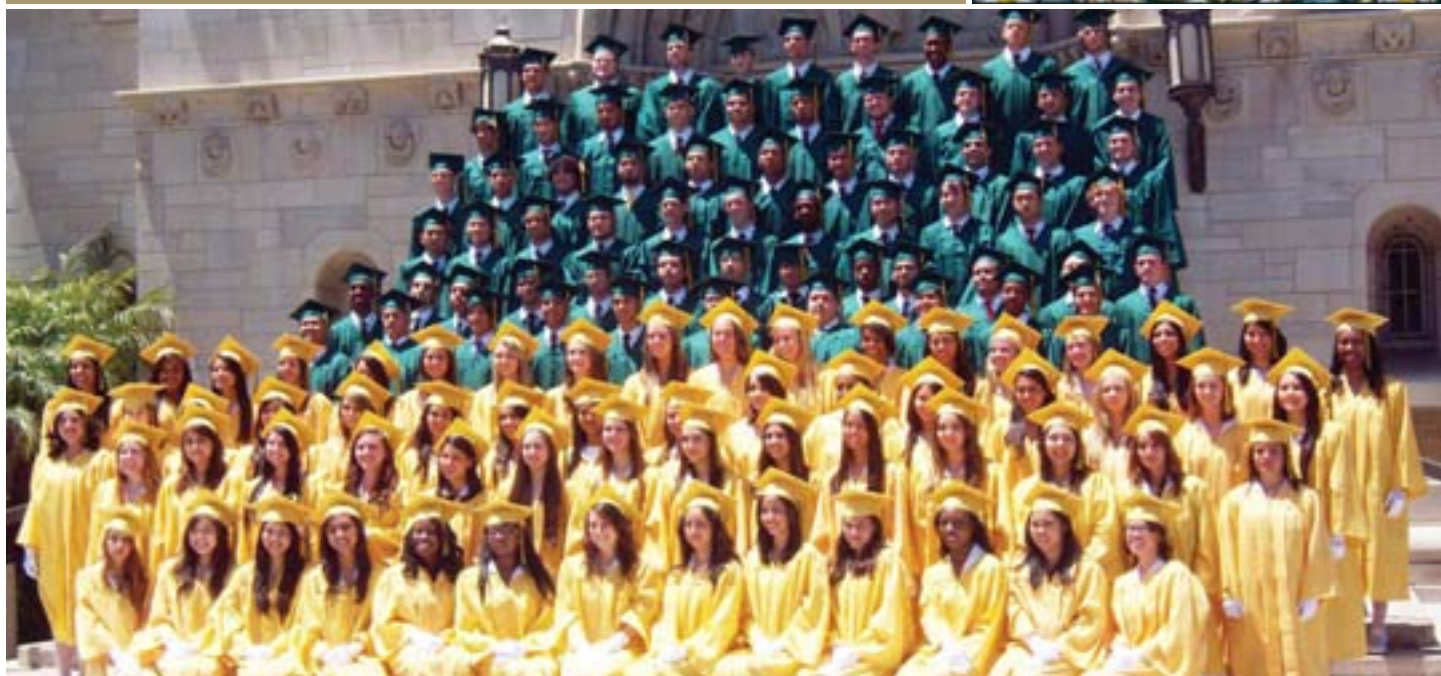
The 2010 graduating senior class of St. Monica Catholic High School!